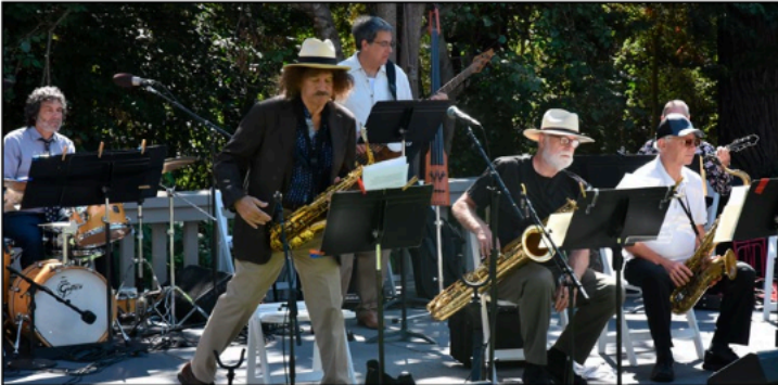
Albany Big Band