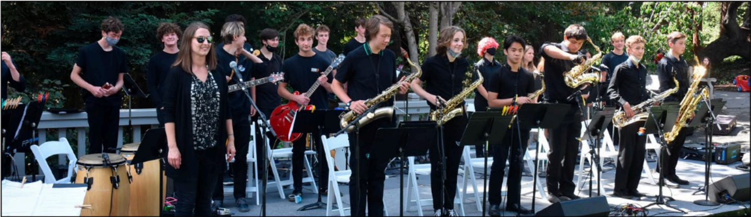
Piedmont High School Jazz Band